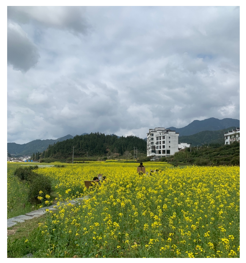
Picture 4: Landscape of the trekking tour taken with the Trekking Club in Fudan (复旦登山协会)