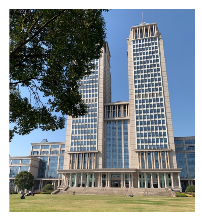
Picture 7: Guanghua Tower, emblematic building of the Fudan University